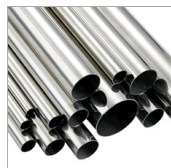
Sanitary Tubes - Pipe